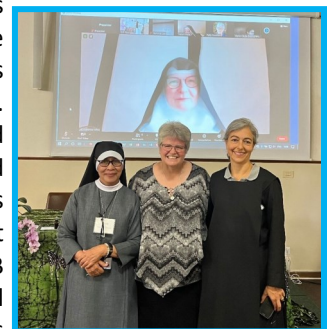
Newly elected Moderator and Administrative Council members (in person and online)