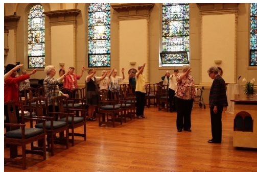
Blessing of Prioress-elect in Chicago